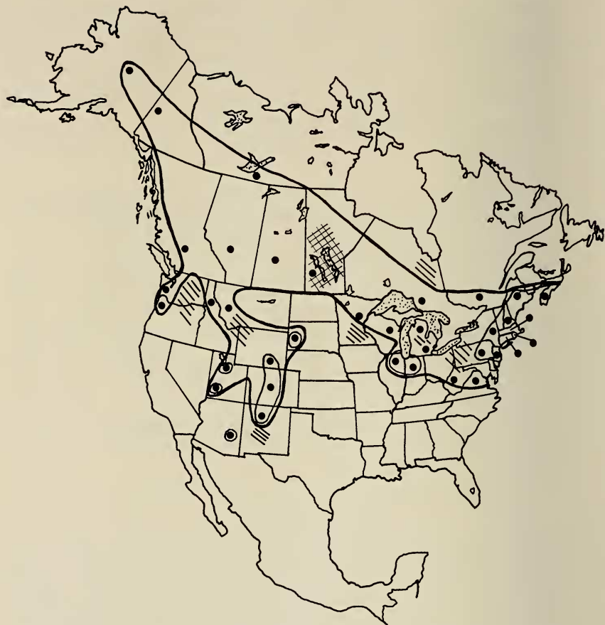
Fig. 1. Distribution of Callophrys polios in North America. Cross-hatched area in Manitoba indicates a blend-zone between the eastern and western subspecies. Solid dots indicate states, provinces, and areas from which collection records exist.

Alberta, British Columbia, Northwest Territory (District of Mackenzie), Yukon Territory, and Alaska. Until recently, there were no records from Montana, although the specimens listed by Elrod (1906) as irus (Godart) are probably polios , or possibly fortis schryveri Cross. Cook (1908) mentioned confusion among various authorities over polios , irus , and henrici (Grote & Robinson). In 1971, S. Kohler found both polios and fortis schryveri in Missoula Co., Montana. The occurrence of polios in North Dakota appears doubtful. Occasional references to the occurrence of polios in California probably relate to the misprint in the Cook and Watson paper, or to confusion of polios with fortis (Strecker).